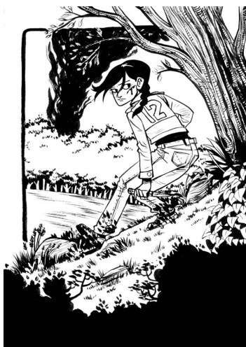
Katniss, in the Arena